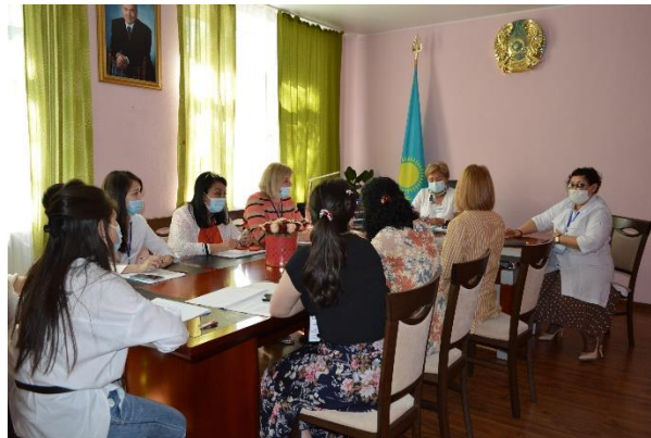
Photo 2. EEC conducts an interview with heads of departments

In accordance with the programme and schedule of external expert work, the EEC members held a meeting and interview with the college management (photo 2). There was a presentation of the EEC members, an acquaintance with the goals of external expert assessment.